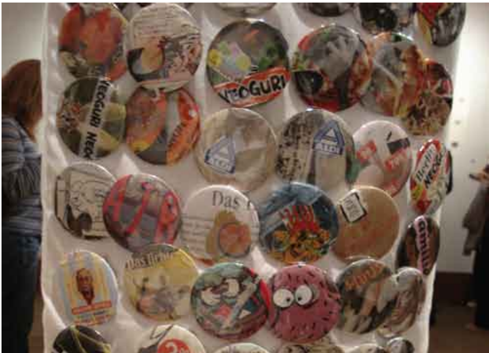
Parabbola, Steinberg Gallery, Washington University in St.Louis, MO 2008