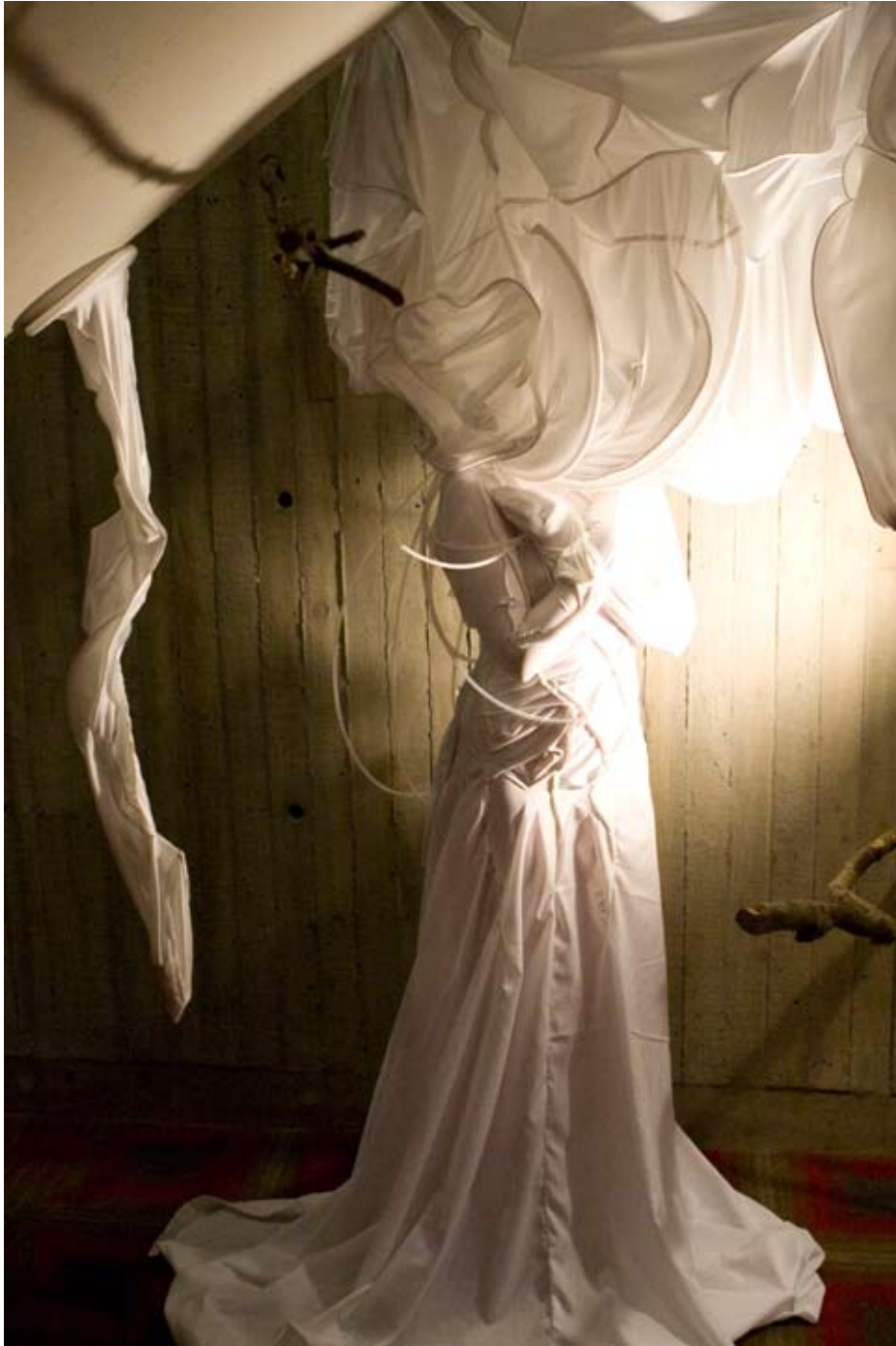
Pupaa Installation at the Meany Theater lobby Interaction with Audience during intermission by recording their sound and replaying on the stage.